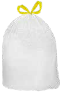
Functional Embossed Flex Bags with Ultra-Force™ Technology