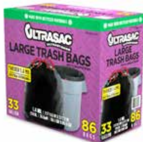
Recycled Content Bag