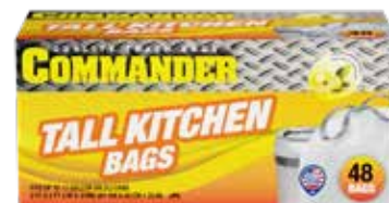
Popular & Custom Scents