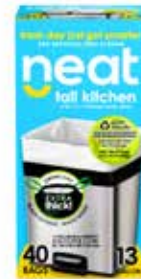
Antimicrobial Odor Control