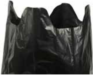
EZ-Tie Flap Bags